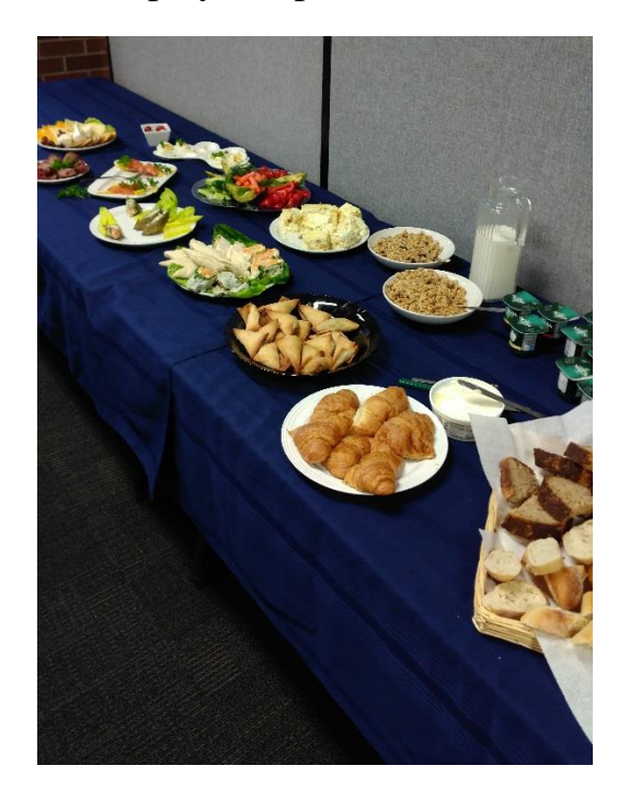
Food Display sample