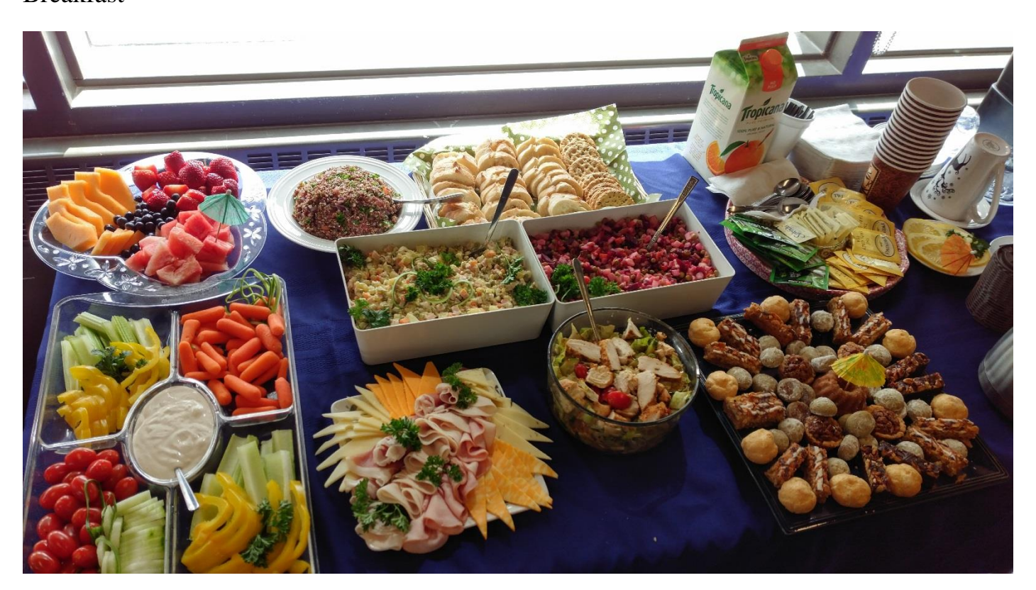
Salad Desert table